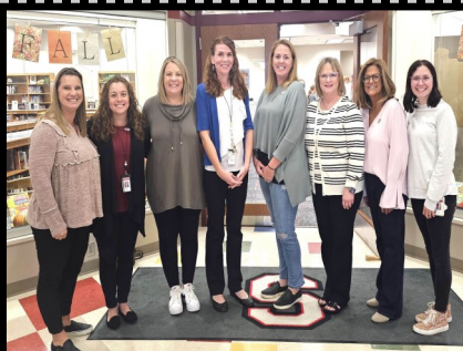
SES Grant Recipients