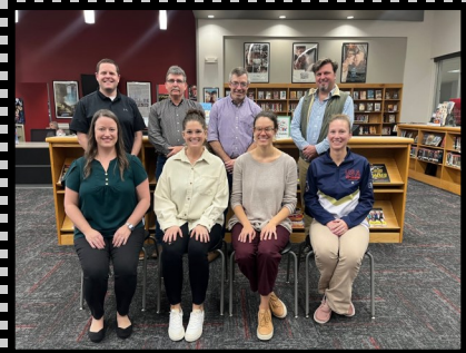
SMS/SHS Grant Recipients